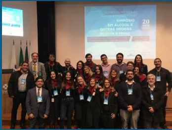
CPAD at its 20 th Anniversary

ICADTS was pleased and grateful to partner with CPAD to organize T2016 in Gramado, Brazil where we had a very stimulating and successful conference